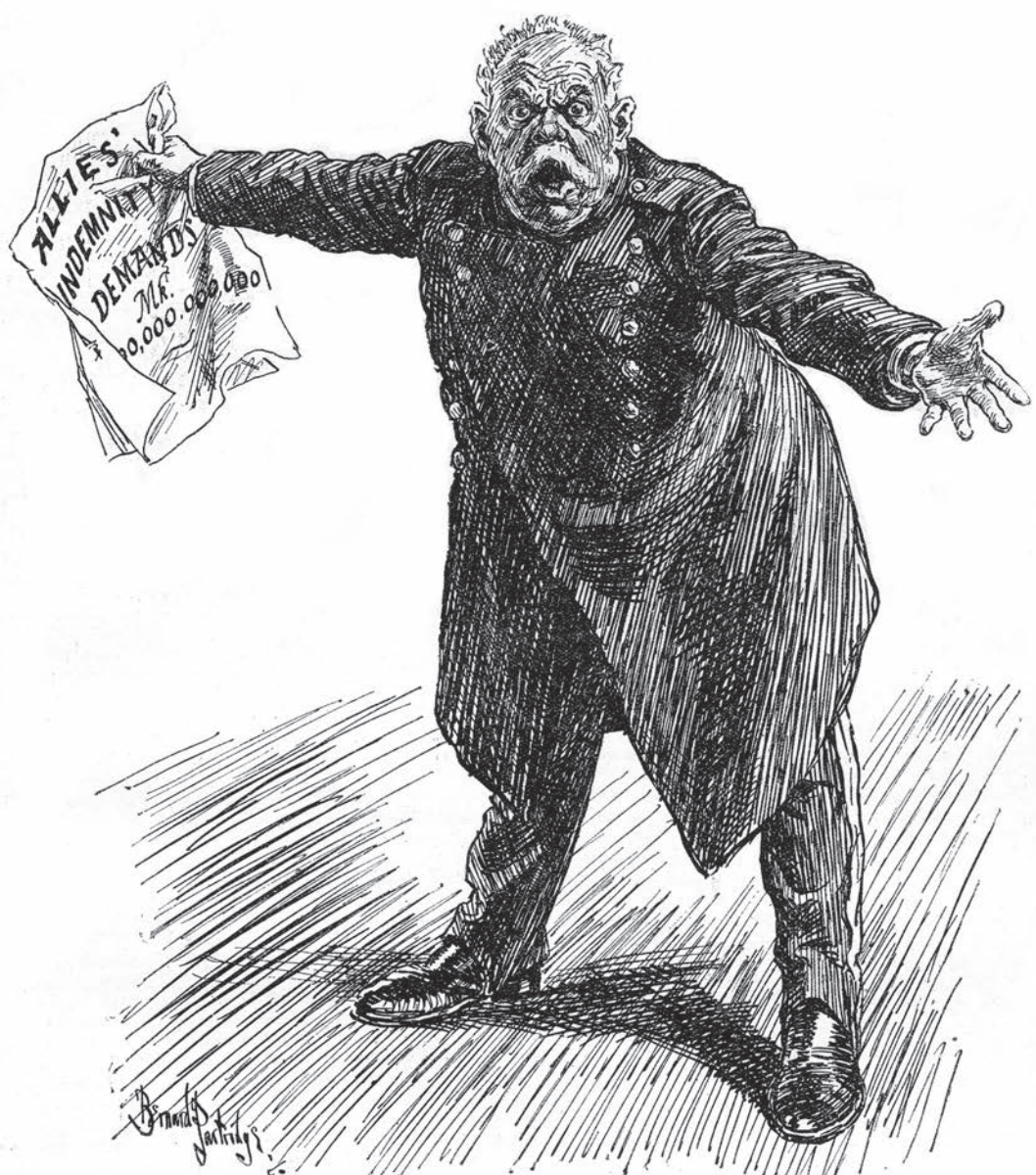
A British cartoon entitled 'The Reckoning', published in April 1919. Germany is saying, 'Monstrous, I call it. Why, it's fully a quarter of what we should have made them pay, if we'd won.' 'Indemnity demands' refers to the reparations.